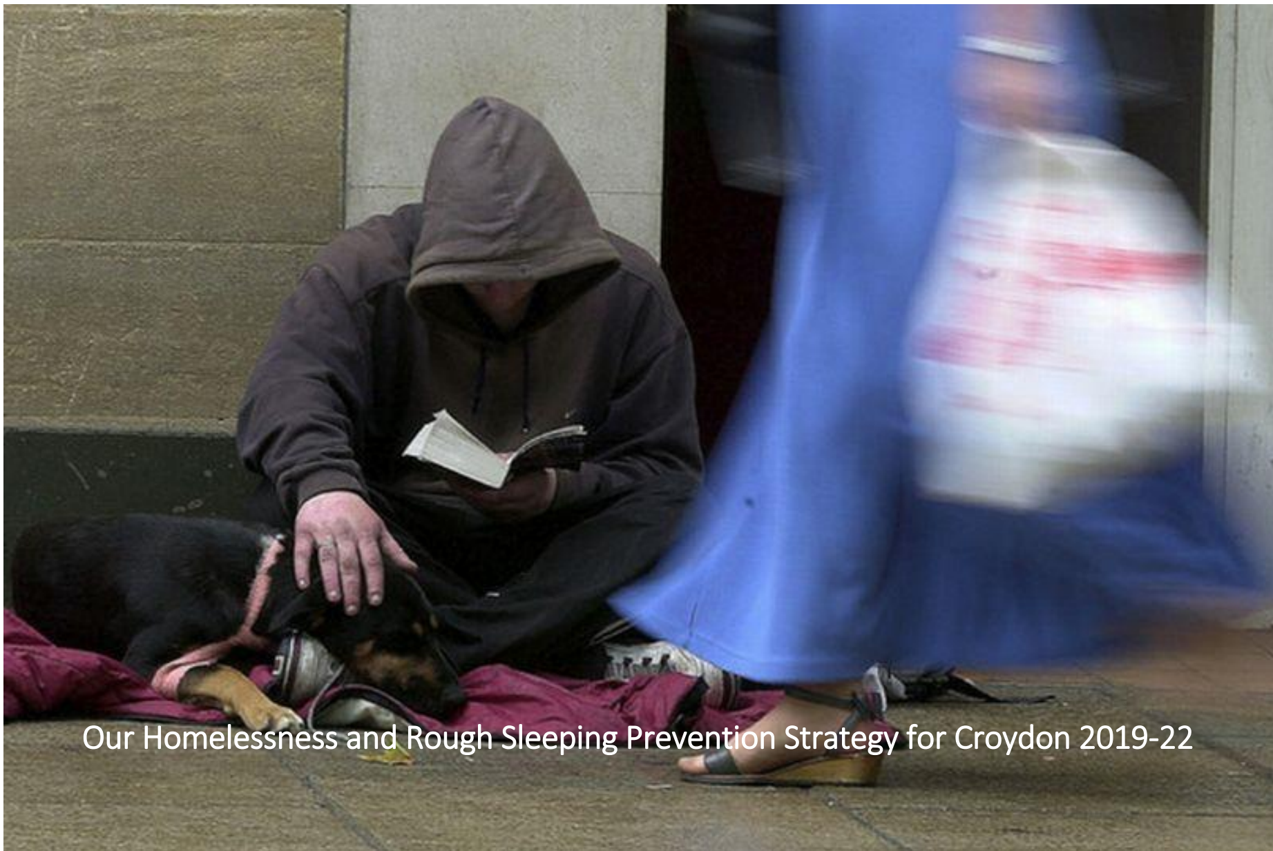
Our Homelessness and Rough Sleeping Prevention Strategy for Croydon 2019-22